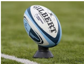
RUGBY AT RYECROFT!